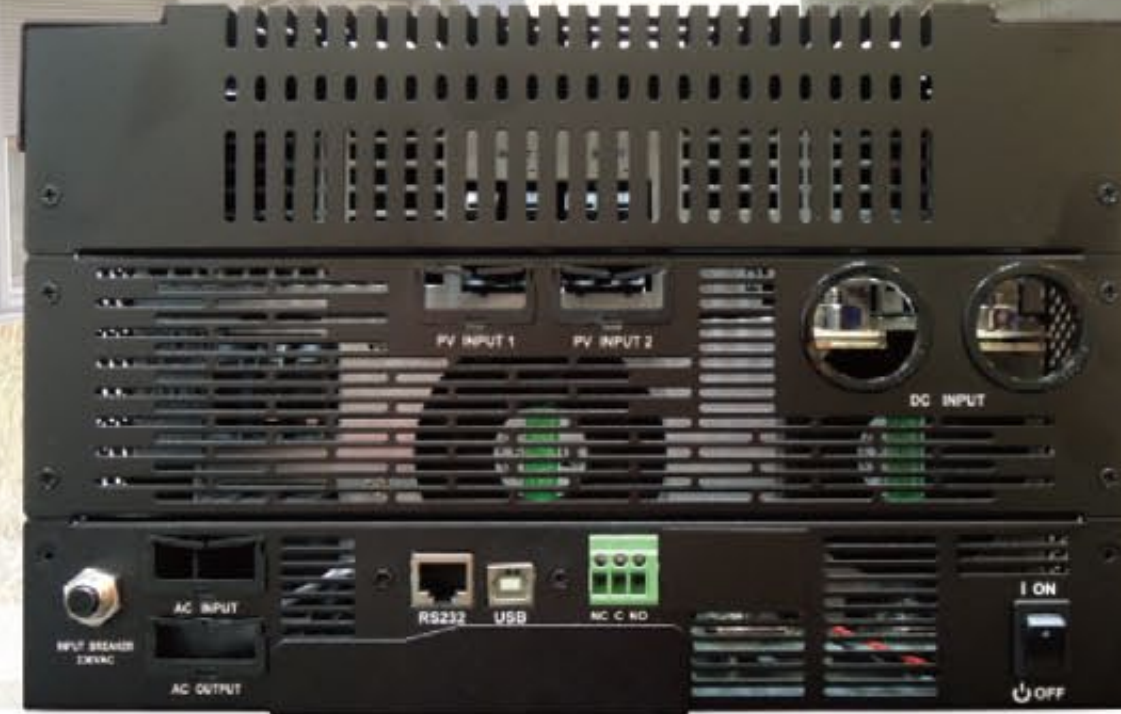
SP5000 Brilliant Plus